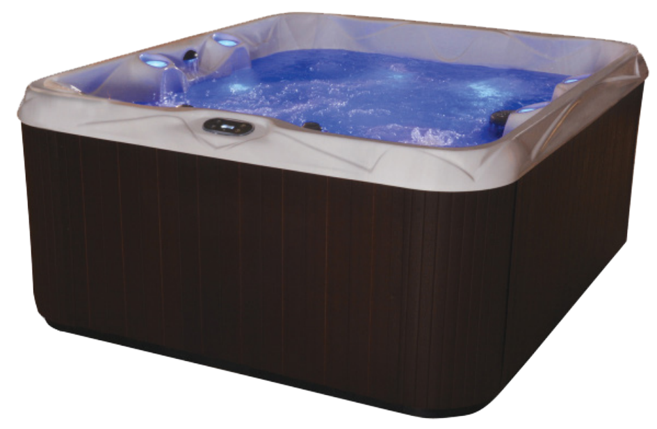
THE RIGHT PRICE TODAY AND OVER THE LIFE OF THE SPA

When shopping for a spa, you should consider both the puchase price AND the ongoing operating costs